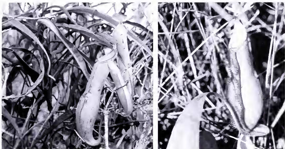
Figure 1: Nepenthes anamensis in Thailand.

in sandy areas, while U. bifida and U. delphinioides grew along the trail within pools and depressions in the peat bog.